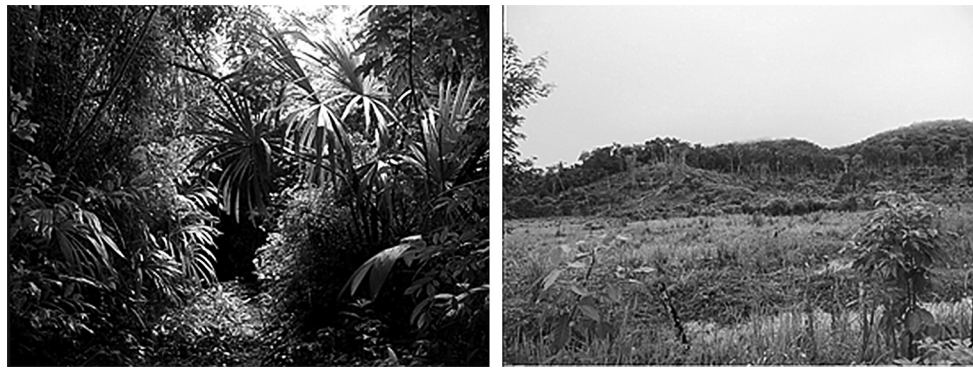
Figure 2. Differences between localities where the spiders were collected: with a high conservation level (left), and with perturbation (right).